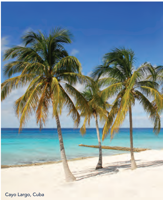
Cayo Largo, Cuba